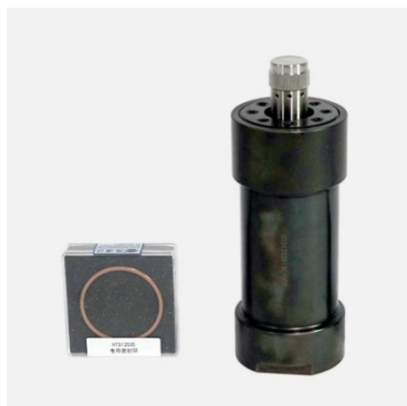
Aging Cells HTD12535

Roller oven is a highly reliable high-quality ultra-high temperature drilling fluid evaluation equipment that is designed and developed based on the classic product-high temperature roller oven. Its maximum test temperature is 600°F (316°C) and it could run four 500 mL or eight 260 mL roller vessels simultaneously. It could efficiently and safely complete experimental duties under severe condition.